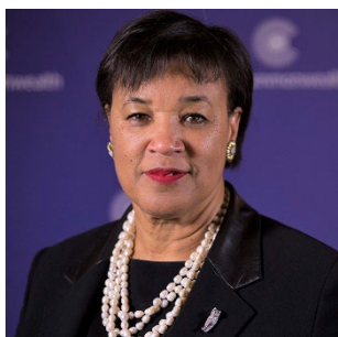
The Rt Hon Patricia Scotland, KC